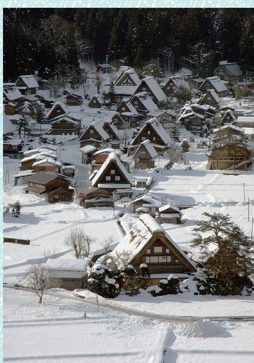
Ogimachi Settlement in Shirakawa-go