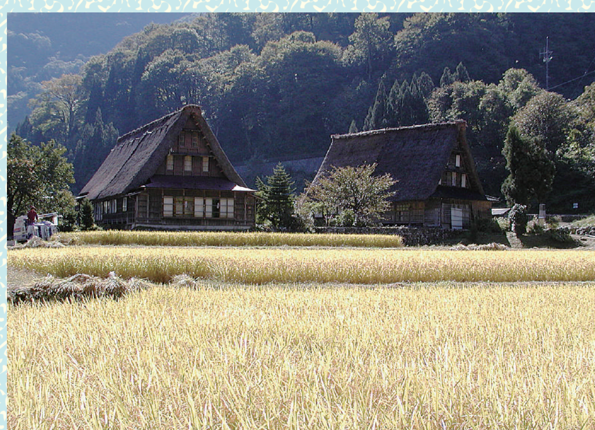
Suganuma Settlement in Gokayama