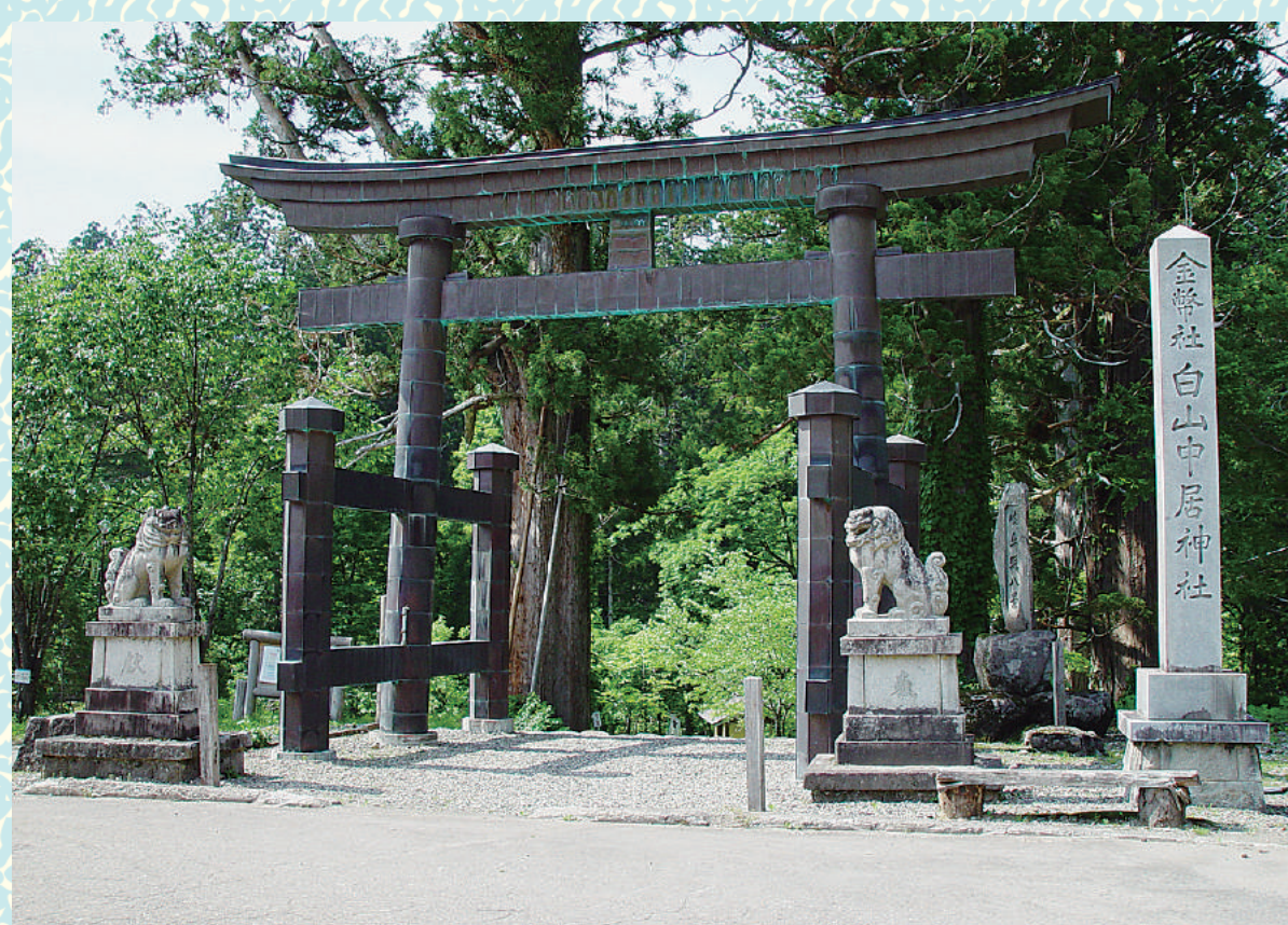
Hakusan Chukyo Shrine