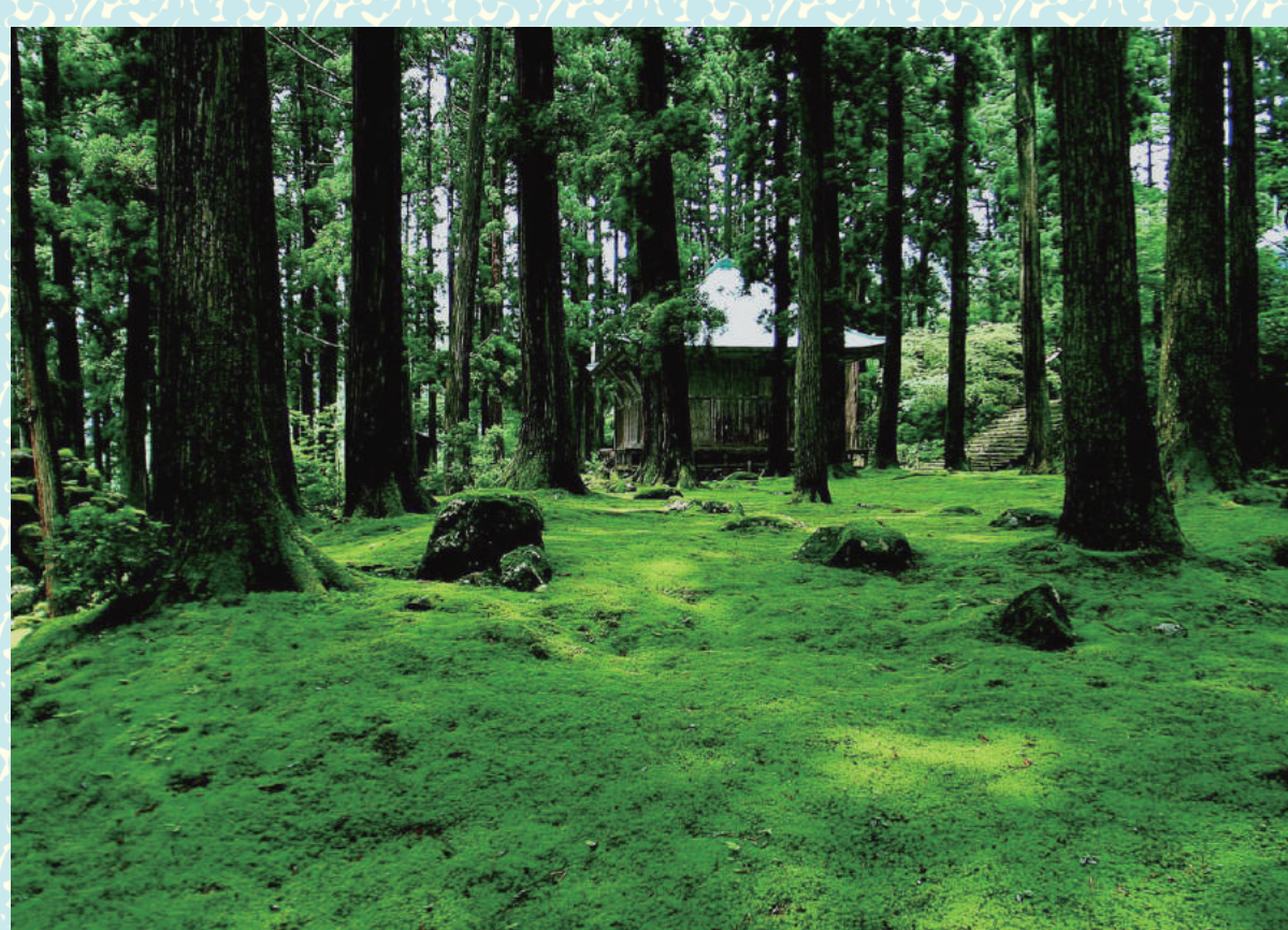
Heisenji Hakusan Shrine