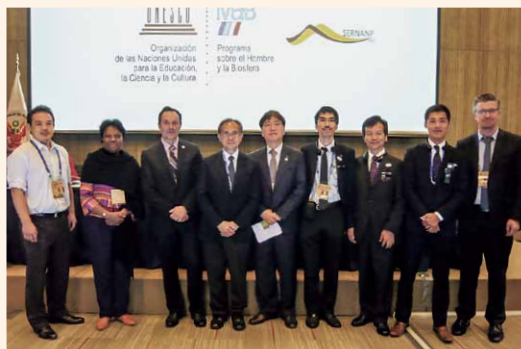
拡張登録決定直後の日本代表団とユネスコ関係者(2016年3月19日) The Japanese delegation and UNESCO MAB key persons after the approval of extension on March 19, 2016

第4回生物圏保存地域世界大会@リマ リマ行動計画(2016-2025)採択 Forth World Congress of Biosphere Reserves was held in Lima. The Lima Action Plan (2016-2025) was adopted