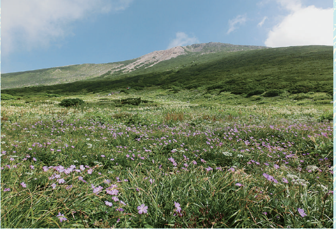
Core area: Alpine meadow of Murododaira