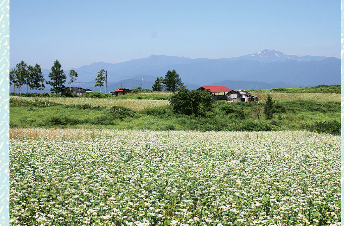
Transition area: Mt. Hakusan and buckwheat field

Since its designation in 1980, there have only been two zones, the core area and buffer zone. But then the transition area, where people lead lives based on the sustainable utilization of natural resources, became emphasized, and we applyed for the extension of the Mount Hakusan Biosphere Reserve, including the transition area. In March 2016, UNESCO approved this extension and we have entered a new stage.